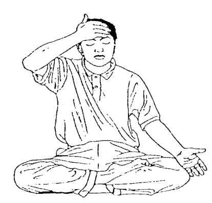
With the hand on the forehead: I forgive everyone! Say this from the heart as many times as you feel necessary.