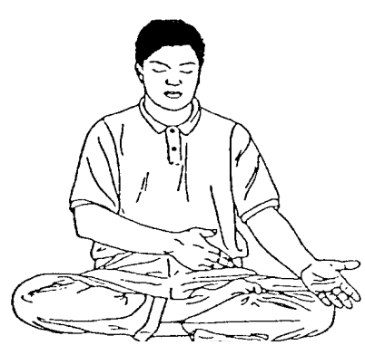
3. With hand on lower stomach: Please may I have the pure knowledge? Repeat 6 times